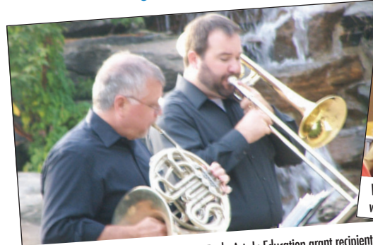
The Giannini Brass, at Winston Square Park, Arts-In-Education grant recipient